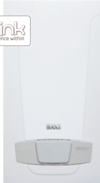
Megafluo System Compact GA Boiler